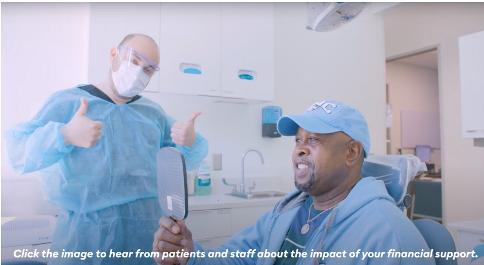
Click the image to hear from patients and staff about the impact of your financial support.

Restoring smiles and confidence to neighbors in need